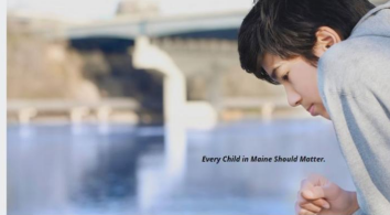
Every Child in Maine Should Matter.